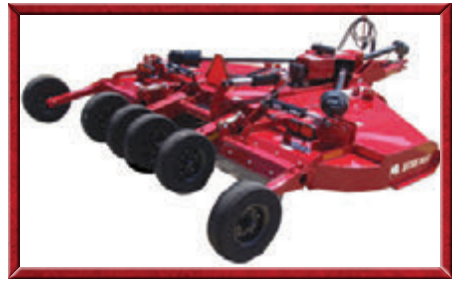
Each axle arm on the center section has a rubber cushion to absorb the shock loads near the wheels. Shown with optional dual tires on the center.