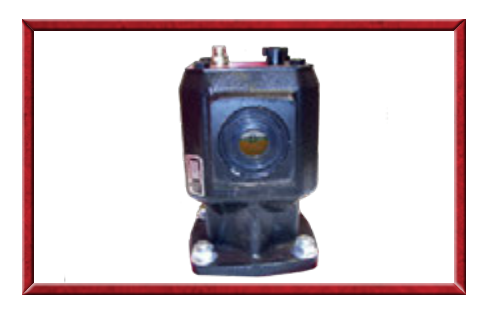
Patented oil sight gauge in all three cutting gearboxes for quick and easy monitoring of oil levels.